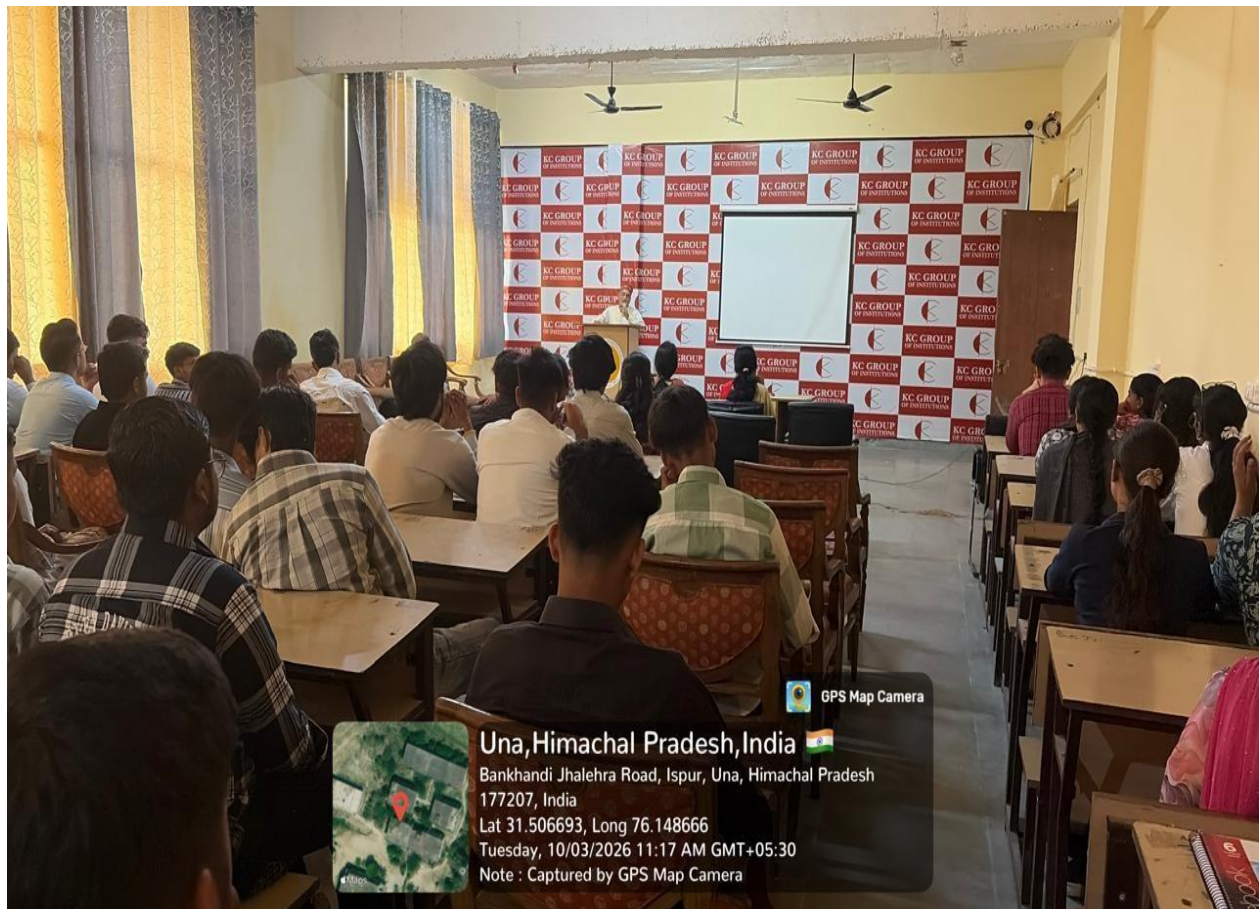
Image 1: Students attentively participating in the Guest Lecture on Bhartiya Sanskriti and Vedic Knowledge at B.Tech Seminar Hall